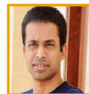
Mr. Gopi Chand Pullela

Founder and CEO, Fitness365, Sequoia Fitness and Sports Technology | Co-founder, Convergent Technologies