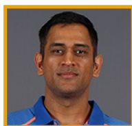
Mr. Mahendra Singh Dhoni